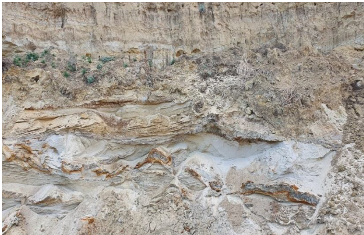
Fig. 4 The lithostratigraphic sequence of Pleistocene deposits at Bârlad Sud.