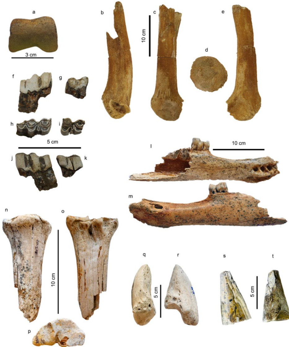
Fig. 5 Upper Pleistocene vertebrates from Bârlad Sud

Testudinidae indet. fragment (a); scale bar: 3 cm