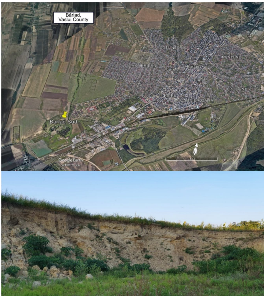
Fig. 1 The Bârlad Sud outcrop, located near the town of Bârlad. General overview of the outcrop.

The Bârlad Sud outcrop lies in the southwestern part of the city of Bârlad (Fig. 1 and Fig. 2), at the foot of Ivești Hill, close to the intersection between the Tecuci Road and National Road DN11A (46°12'22.67"N; 27°38'33.57"E).